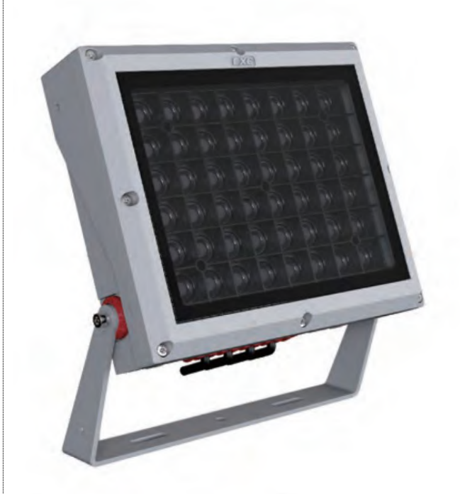
Application Environment: Indoor Outdoor